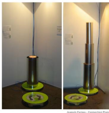
Joaquin Fargas - Connection Plaza

This means that two persons have established a non conventional communication because video and audio are not involved.